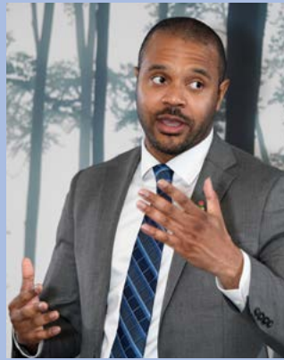
State Senator Jabari Brisport

Dr. Byer pointed to poor access to healthcare, underlying chronic conditions, structural racism and implicit bias as major contributors to the troubling statistics. “Women of color are less likely than white women to have access to quality maternal healthcare,” he explained. “Black women have the highest uninsured rates among all women, are more likely to have chronic health conditions that are risk factors for maternal death, and are less likely to get care for disease prevention and management.”