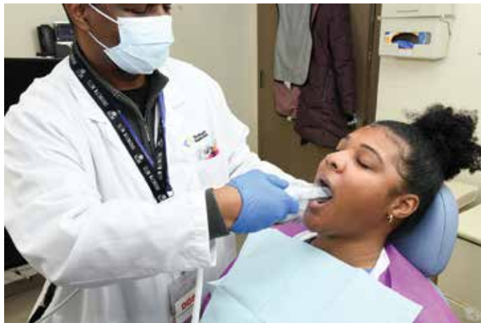
Employee-Funded Project: Dental Intraoral Scanner