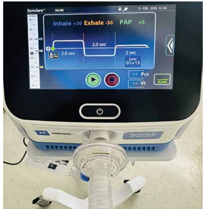
Employee-Funded Project: Cough Assist System