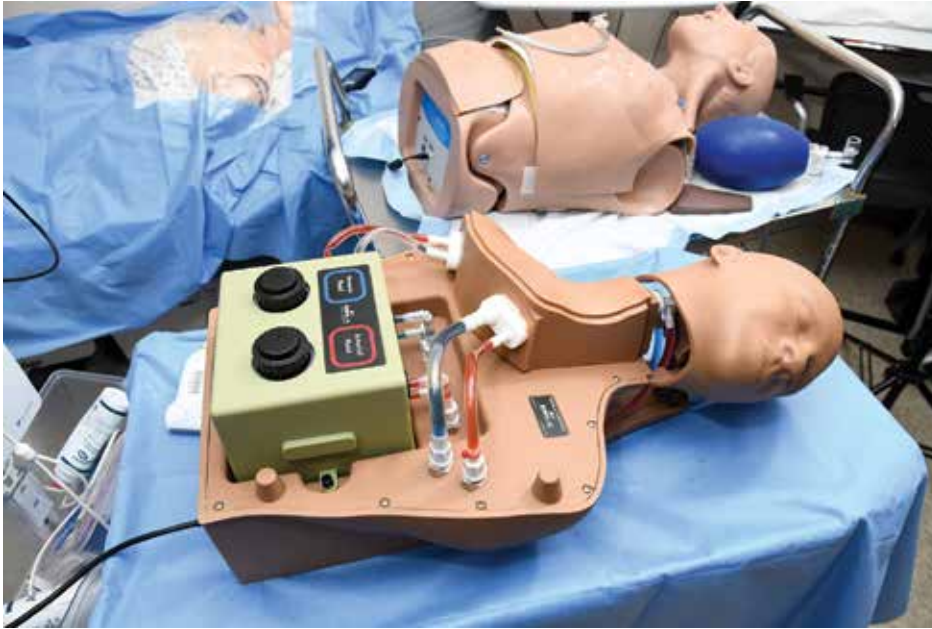
Employee-Funded Project: Vascular Access Simulation Trainer