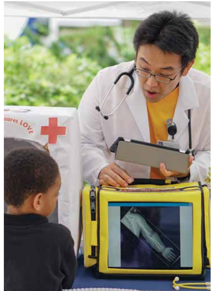
Reaching out to our youngest neighbors